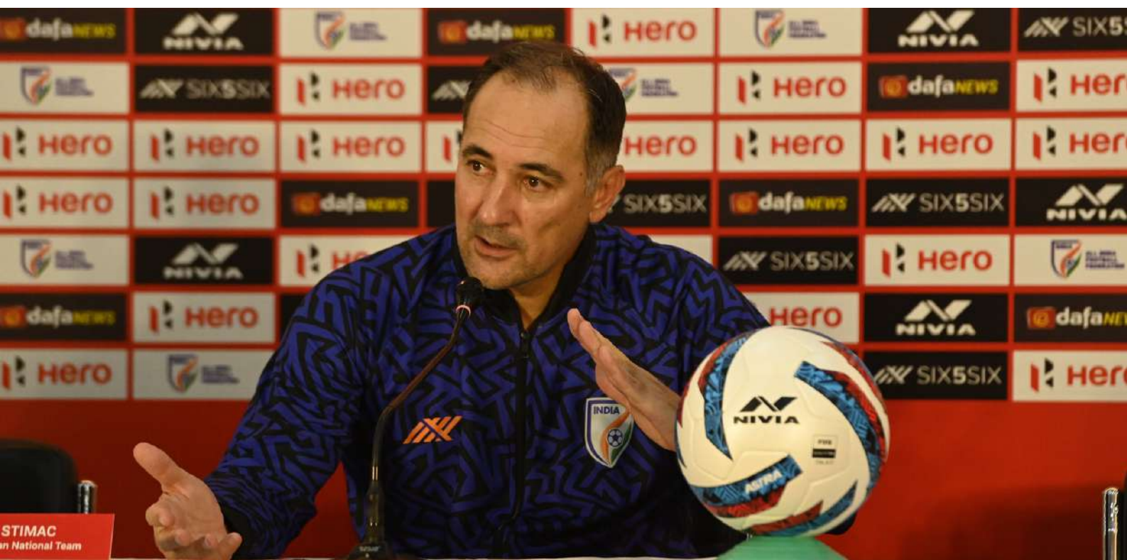
STIMAC in National Team

Stimac: It has been a difficult journey. I say that because the expectations are huge on India. It's wonderful to have dreams. There is no life without dreaming about achieving things. And to succeed, time is precious. You can count on fulfilling your dreams if you are provided time to work. I just hope that the next eight or nine months will serve us well to prepare for the Asian Cup. The calendar for the next season is going to be difficult. We want to utilise the September, October and November international windows well, and I hope all stakeholders of Indian Football get involved and help the national team.